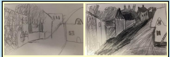
Year 5 sketches of Houghton using perspective.