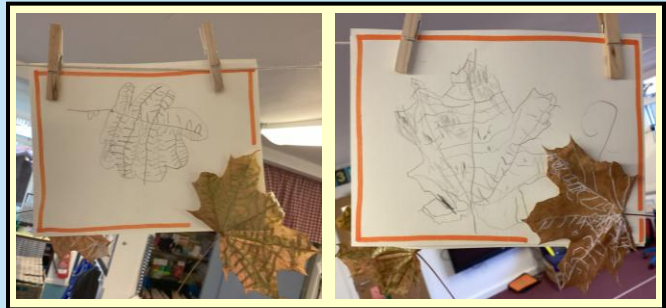
Foundation Stage leaf sketches using line.