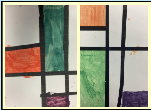
Year 1 Mondrian work using colour mixing of secondary colours.

I'd like to start by saying a huge thank you for all the art supplies and art books donated to school during the summer term. They have been dispersed amongst the classes to help enrich our curriculum and are already being put to good use to create artwork and learn about artists. So far this term, classes have explored how to colour mix paint to create work in the style of existing artists and developed their sketching by focussing on improving specific skills. I have really enjoyed the chance to talk to the children about their artwork, feel the children's excitement in the classroom when experimenting with new skills and see the fantastic end results of their learning. We have many more art projects to come this year, and I can't wait to see the creativity Houghton has to offer.