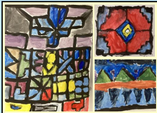
Year 4 Ndebele artwork using colour mixing of tertiary colours.