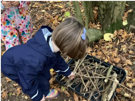
Gathering sticks for the Bug Hotels

Thank you for all the daffodil bulbs. We can't wait for spring! Every child has planted some as there were enough to share around.