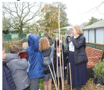
Eco-committee get the grand tour