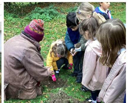
Planting daffodil bulbs for springtime