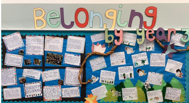
Our Jungle Book Writing is brightening up our practical area!

On Friday 27 th September the photographer is in school for individual photos so please remember smart jumpers or cardigans and big smiles! The photographer will be in the school hall from 8.20am for families that would like to include preschoolers in a family photo.